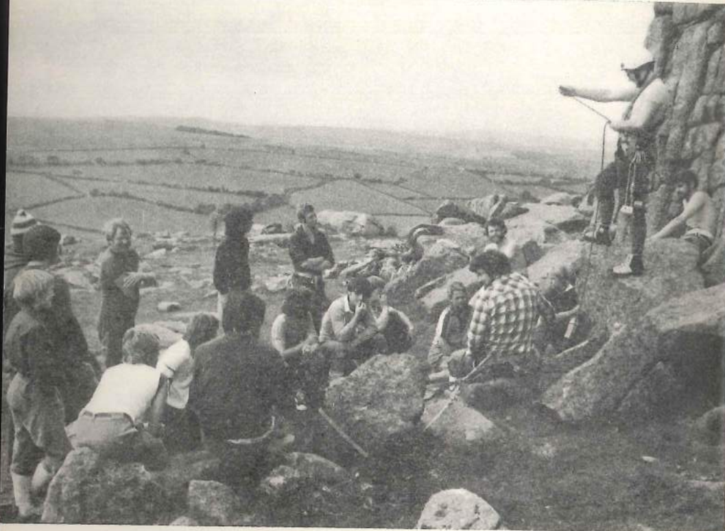
One of the range of regional events