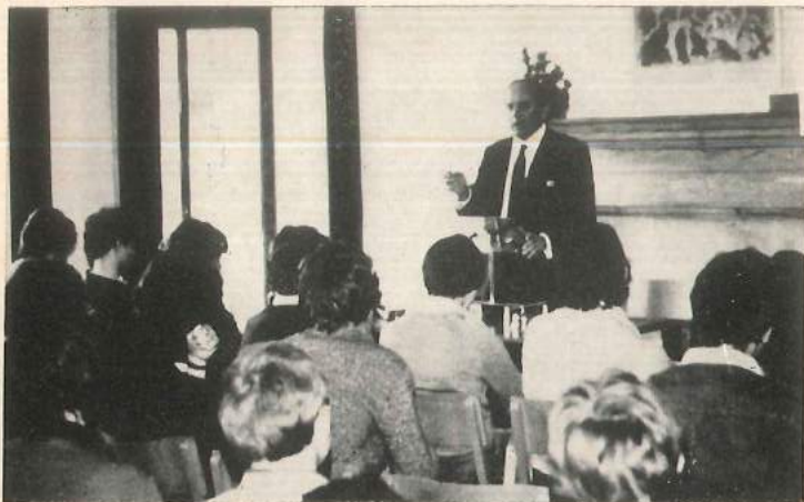
A time to listen and a time to learn