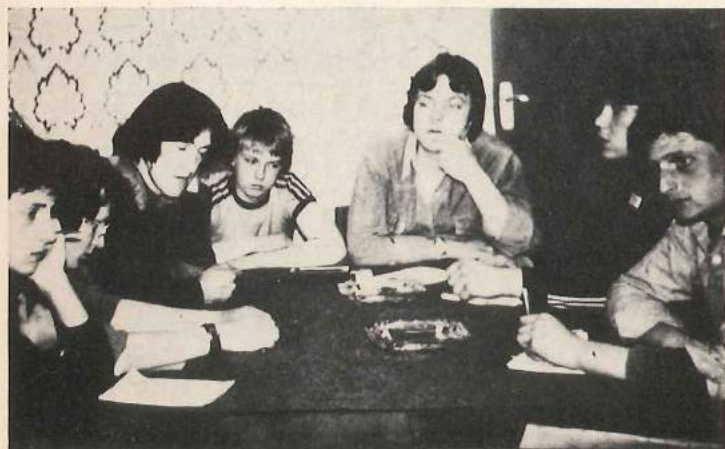
Group Tutorials are serious business