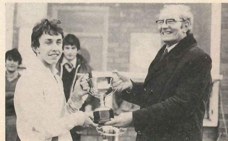
Gordon League, Gloucester, win the National 7-a-Side Trophy for the second time