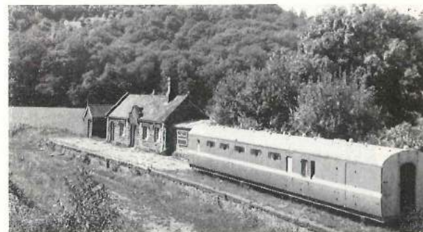
Kerne Bridge now the personal Adventure & Training Centre for many groups.

SPECIAL WEEKS Organised by Avon National Boys' Club members, for children in need, two special weeks during August.