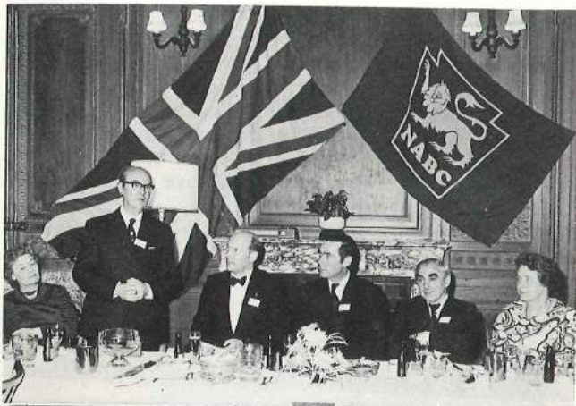
Guests and Apprentices at the 100th Course Dinner

Unknown to the Organising Secretary arrangements had been made to record his involvement with these and subsequent Courses over the past 20 years. Many friends from Committees and Industry had contributed to a Presentation which included an inscribed cut-glass rose-bowl, a scroll lettered to mark the occasion and the many friends who had been associated with it, and a very handsome cheque. Members of Apprentice Groups using the Courses presented him with some very practical and useful examples of their skills. The Secretary in expressing his thanks said that this was an evening he would always remember, adding as it did to a year which for him had started so auspiciously. He would value and make good use of the many gifts but most of all he would remember the kindness and help of so many people who really made this side of our work possible.