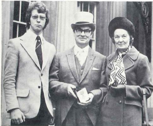
Our Secretary with his wife and son after the Investiture at the Palace